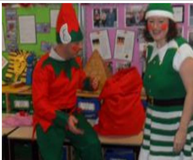
SANTA'S ELVES GIVE OUT GIFTS TO THE CHILDREN